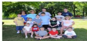
K'TON TON NAGILA/ KADIMA