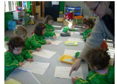
3 Y worked very hard on their snowflake fingerprint project!

Our three year old students have been learning all kinds of wonderful things through discovery play. They have reviewed the letters A through G during the past weeks; and we "swung" into G with a mini golf practice right in our own 3Y room.