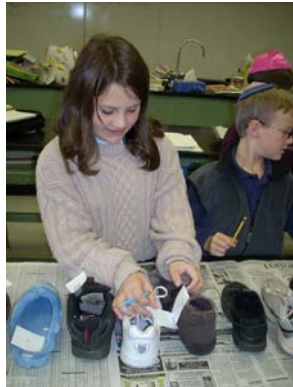
Adina checking for accuracy!

The fifth grade students at UHI recently participated in a lab activity which allowed them to classify a group of familiar non-living objects. Each student placed several