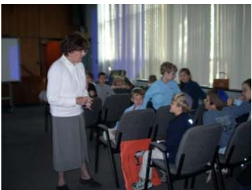
Below: Geveret discusses Yom Kippur with students